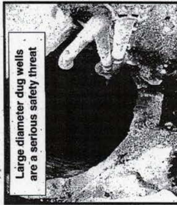
Large diameter dug wells are a serious safety threat

The DEQ recommends that property owners hire registered well drilling contractors to plug abandoned wells. Registered well drillers have the specialized training and equipment necessary to properly plug abandoned wells.